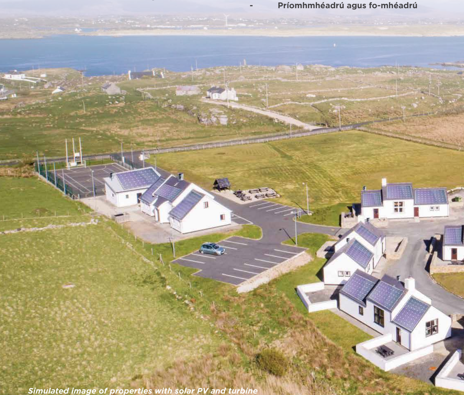
Simulated image of properties with solar PV and turbine